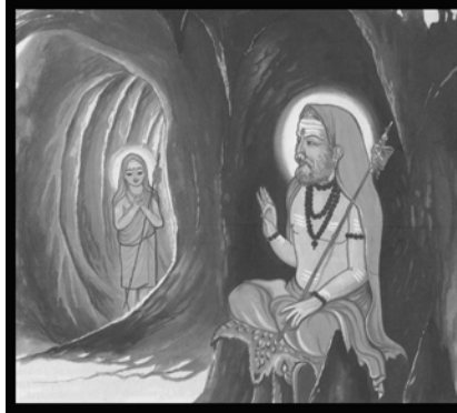
Shankaracharya meets his Guru Sri Govindapada

Attaining a state of true sannyas is essential in the realization of supreme truth through the path of nivritti. As long as the outward flow of thoughts and urges are not reversed into deep inner contemplation that seeks the source of perturbation, and is eventually silenced by stillness of the chitta (heart-mind ensemble), the yogi cannot attain the harmonious state of both union and awareness (yoga-yukta). Without such