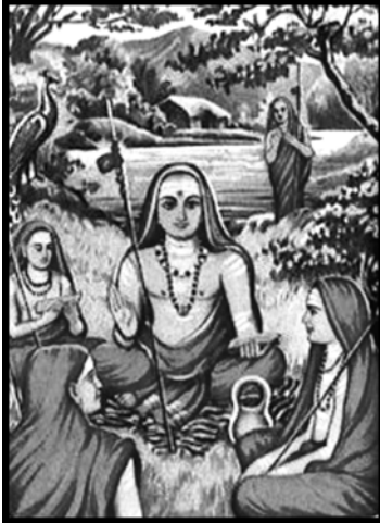
Adi Shankaracharya with his four principal disciples whom he initiated into monkhood